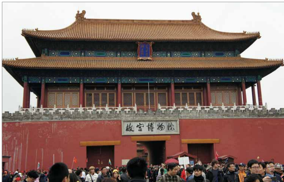
This is the northern gate to the Forbidden City, which was the home of Chinese emperors for almost 500 years. It was built in the early 1400s. Walking through the Forbidden City is like walking through history. Inside there are hundreds of buildings including beautiful palaces. The Barrington 220 team was told that people would wait outside the gates for their entire lives hoping to see the emperor.

I shared that the typical Barrington High