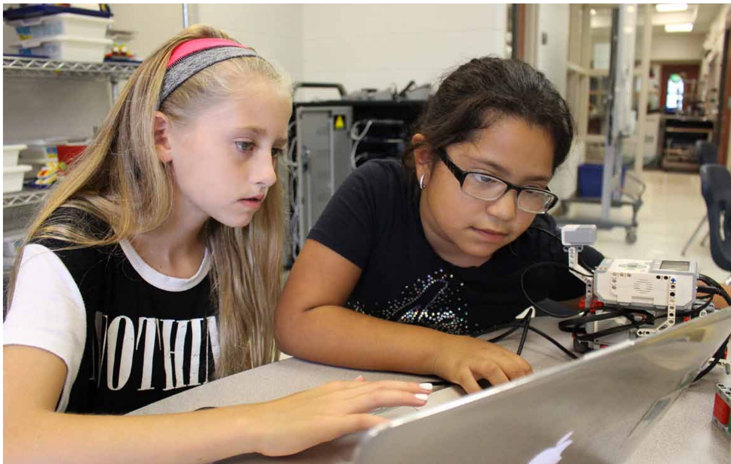
Barrington 220 elementary grade students are introduced to STEM curriculum in a pilot program.