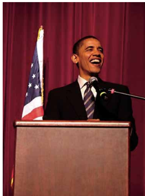
U.S. Sen. Barack Obama addressed students, staff and community members in the BHS auditorium in April 2006.