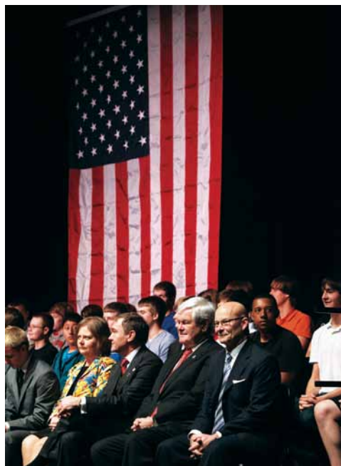
Former Speaker of the U.S. House of Representatives Newt Gingrich spoke at Barrington High School in March 2012.