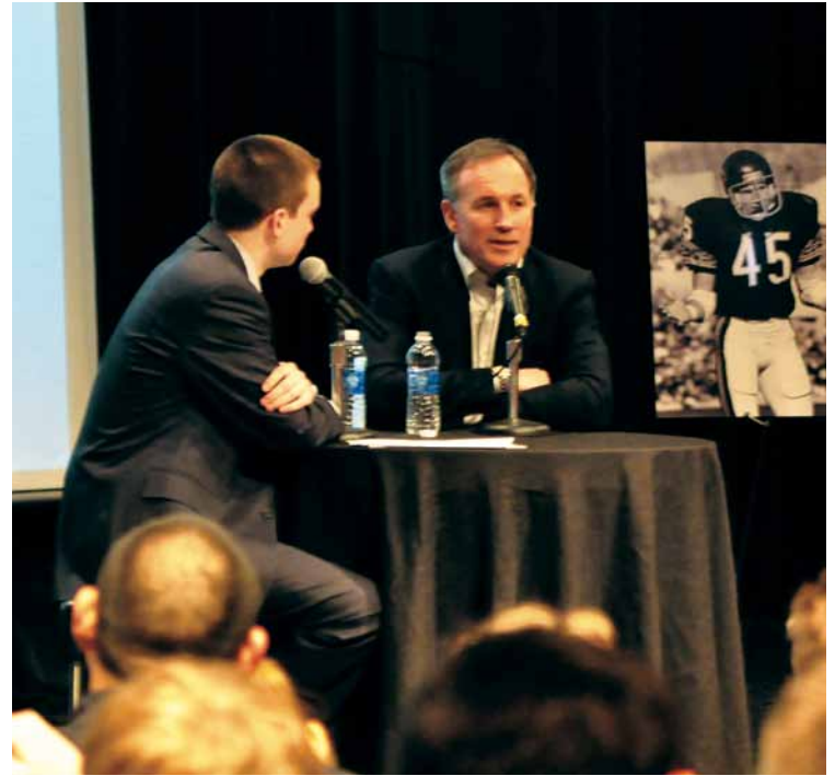
Bear's great and BHS alumnus, Gary Fencik, visited the high school for an Educational Foundation Legends event in March 2013.

Partnering with the Barrington 220 Educational Foundation and the PTO Presidents Council, we regularly host legendary authors, speakers, and athletes such as BHS alumnus and Chicago Bears standout, Gary Fencik. Other guests have included Holocaust survivors, artists, engineers, scientists, astronauts, poets, Tibetan monks, and, recently, a very non-punctual performer known as Rihanna.