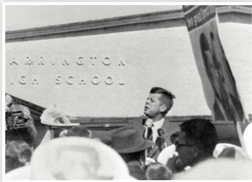
U.S. Sen. John F. Kennedy spoke on the front steps of Barrington High School just two weeks before his election as President in October 1960.

visited BHS in 1960, just two weeks prior to his election as president. And before he became our current president, Sen. Barack Obama also met with students at the high school in 2006.