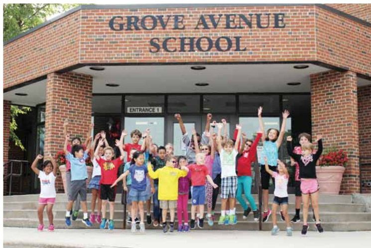
Grove Avenue Elementary School students celebrate.