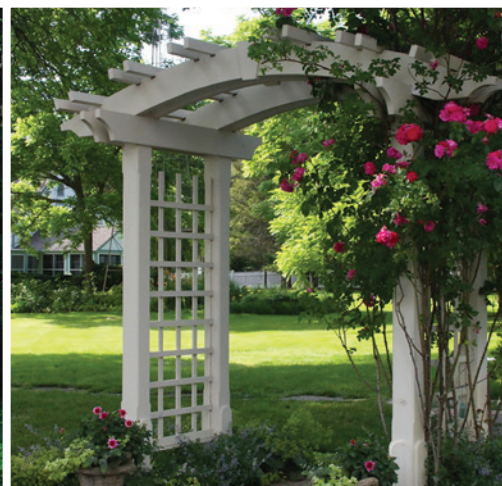
A sneak peek into one of the many Hands of Hope's outstanding gardens.