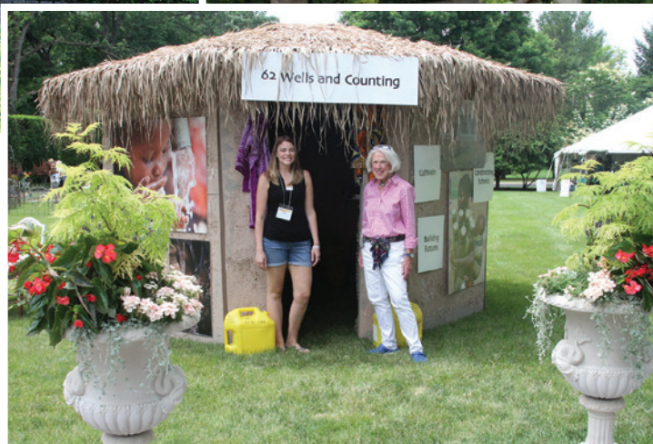
Hands of Hope volunteers highlight the organization's accomplishments.

Participate in interactive and informative workshops led by local garden