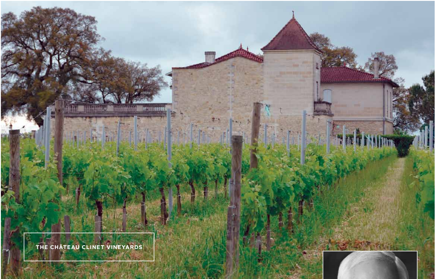
THE CHÂTEAU CLINET VINEYARDS