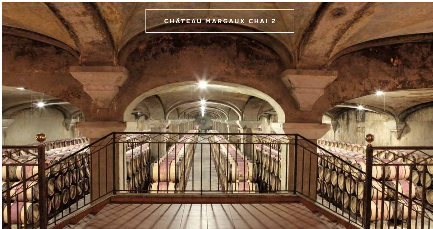
CHÂTEAU MARGAUX CHAI 2