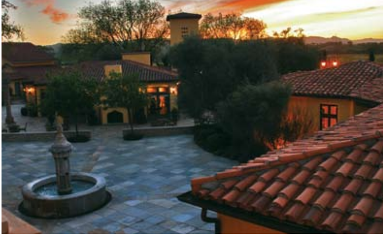
The sunset at Villa Toscana.

and wine served during the 4 to 7 p.m. happy hour. In fact, many guests do not go out for dinner after this feast.