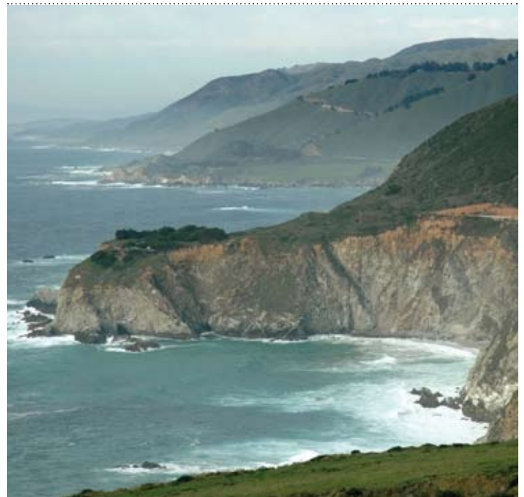
The sweeping coastal vista seen from a ride on the Pacific Coast Highway near Santa Barbara, California.