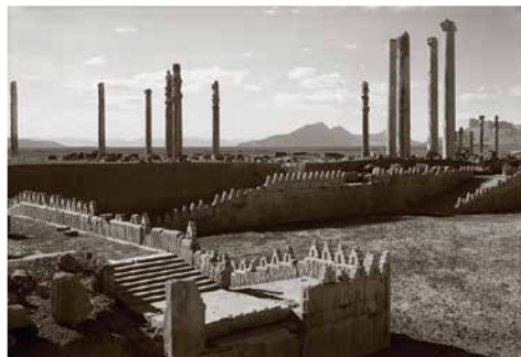
The original Indiana Jones, James Henry Breasted, founded the Oriental Institute in Chicago.