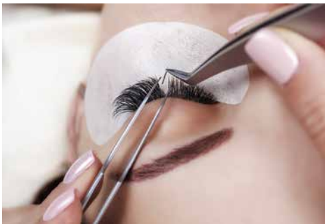
Expertly applied eyelash extensions.

In addition to hair services, Salon & Spa 530 is a Schwarzkopf signature salon and carries top salon brands, including Bumble & bumble, Schwarzkopf, Surface, Moroccan Oil, Keratin Complex, Sebastian products, and Locked & Loaded for men.