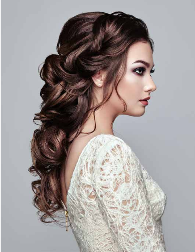
Hairstyles for special occasions include updos, braids, and more.