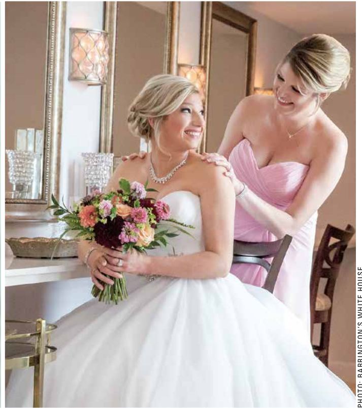
This bride chose Salon & Spa 530 for her wedding hair and make-up.