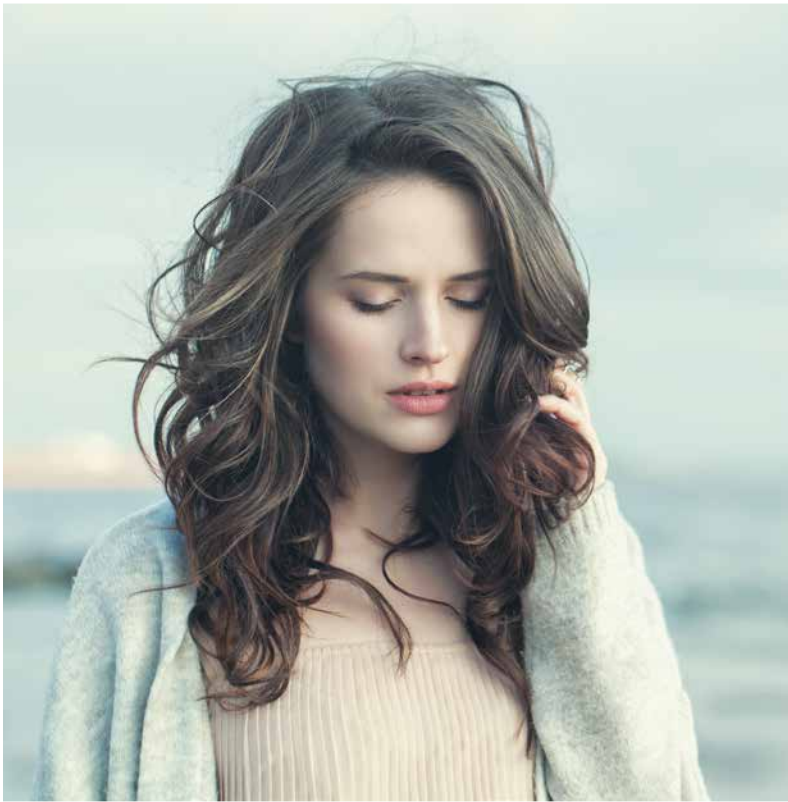
Beach waves any time of year!