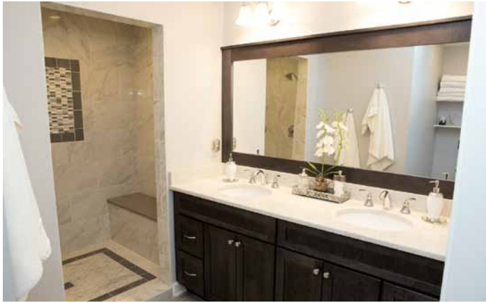
Heated floors and marble tile warm this completely reconfigured master bath with walk-in shower that is well-appointed for retirees.