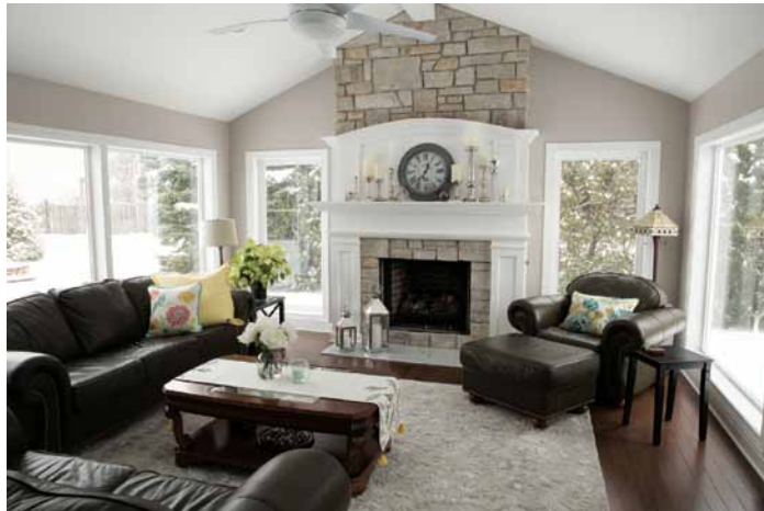
Retired homeowners start each morning with a cup of coffee and a view in their custom-designed four seasons room, complete with a gas fireplace.

the homeowner with full knowledge of the end cost. Only after this process is complete are final design and construction drawings completed. The project then transitions smoothly back to the construction manager whose field team completes the project as designed, greatly minimizing any surprises to the homeowner.