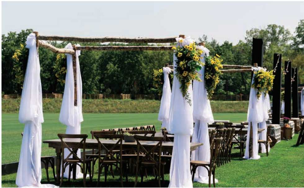
The Barrington area is perfect for outdoor summer events.