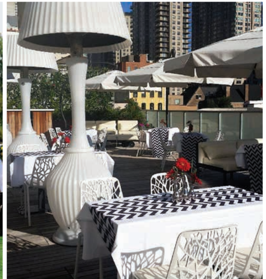
The city has a variety of outdoor spaces for your summer soiree.