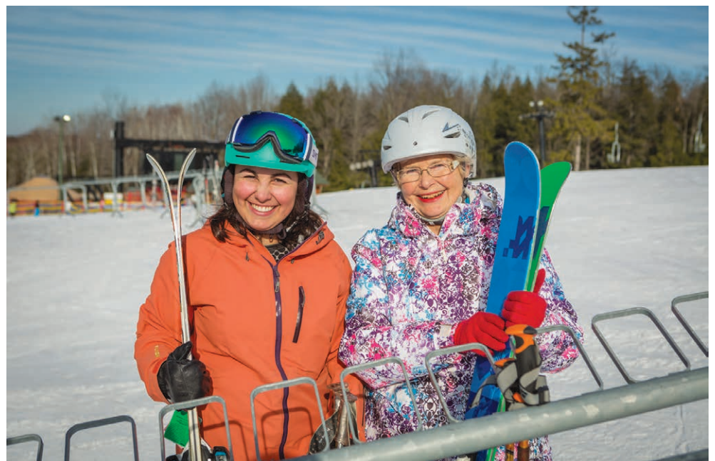
Granite Peak caters to skiers of all ages and abilities.