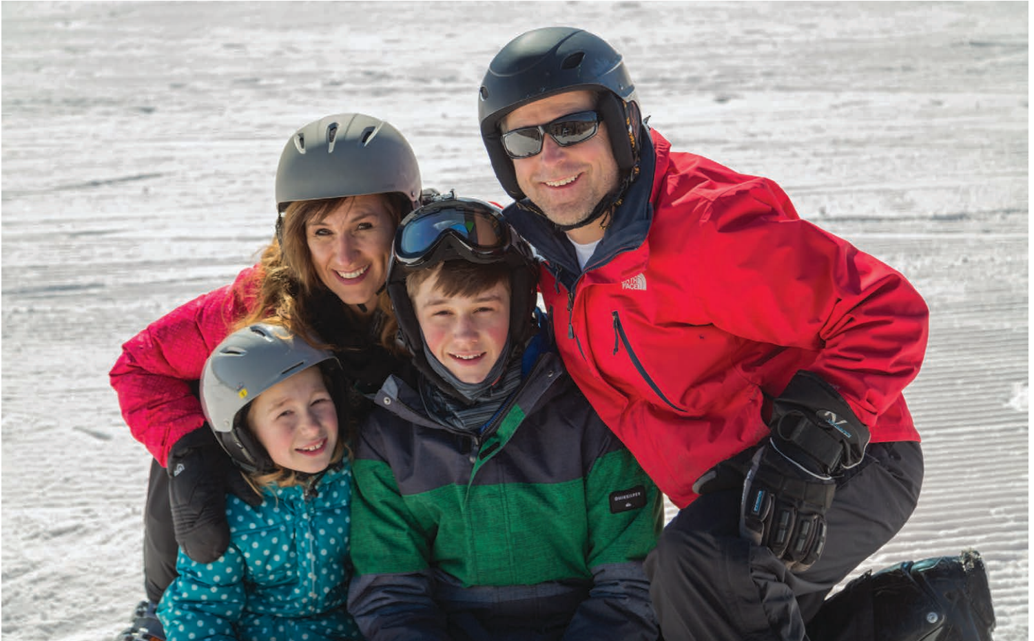
Granite Peak in Wausau, Wisconsin is known for being a Mountain of Family Fun!