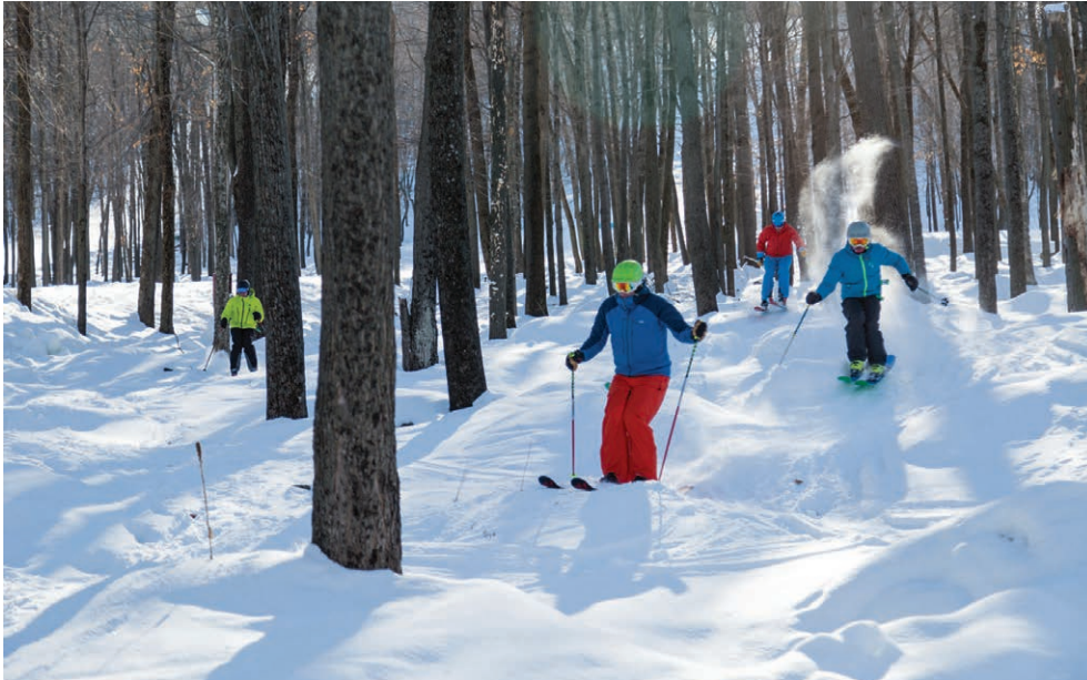
Tree skiing glades are unique to Granite Peak and provide adventurous terrain for intermediate and skilled skiers.

And when they're finished for the day, there's plenty of activities for the entire family in the Wausau-area. There are dozens of hotels to choose from, an eye-popping number of restaurants from gourmet to casual, top flight entertainment, and an active arts scene.