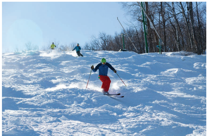
Granite Peak features some of the best mogul runs in the Midwest.

Pack-Up the Car in The Morning, Ski in the Afternoon Situating in the ski town of Wausau, Wisc., which is at the base of Granite Peak, you can experience great skiing in the day and a vibrant nightlife in the evening. Located conveniently near Chicago and Milwaukee, Granite Peak boasts high-speed lifts that move your family up the mountain quickly so they have more time to ski or board.